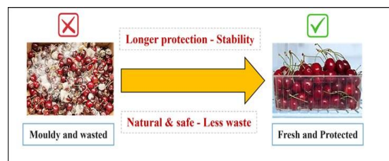
Figure 2: Application in sweet cherry preservations

The optimised encapsulation material showed several advantages over starch or \beta -CD used alone. It could hold a larger amount of preservative, a more stable structure, and its porous particles securely trapped p-anisaldehyde inside (Gao et al. , 2025). Most importantly, the material released p-anisaldehyde slowly and continuously as a gentle vapour. This controlled release provides longer-lasting protection and improved preservation efficiency. To test the system, researchers placed small sachets containing starch– \beta -CD capsules loaded with p-anisaldehyde inside sealed cherry storage containers. The capsules slowly released the natural compound, creating an invisible protective layer around the fruit without affecting its taste or leaving any residue (Zabot et al. , 2022). As a result, the treated cherries remained fresh, firm, and free from mould for up to 12 days, nearly twice as long as untreated cherries, which developed mould within 6 days, as illustrated in Fig 2 (Gao et al. , 2025). The method also reduced weight loss, better preserved colour, sweetness and vitamin C, and extended shelf life.