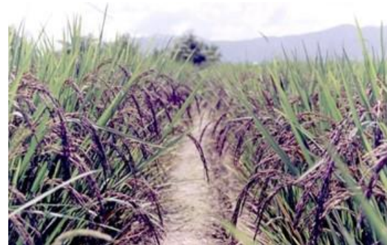
Fig 1: Kalonunia paddy in the field

Govt of India, 2024). Given the ongoing loss of traditional landraces, there exists a collective responsibility to conserve Kalonunia for future generations.