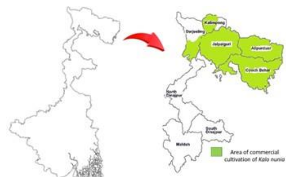
Fig 2: The area of cultivation of Kalonunia rice in North Bengal